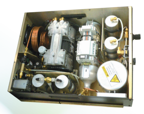
ZAG7001 - internal view