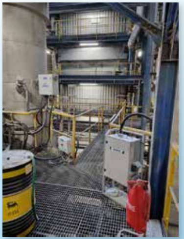
Raw gas application (Hg measurement upstream of smoke treatment)

Emissions application (Hg stack measurement)