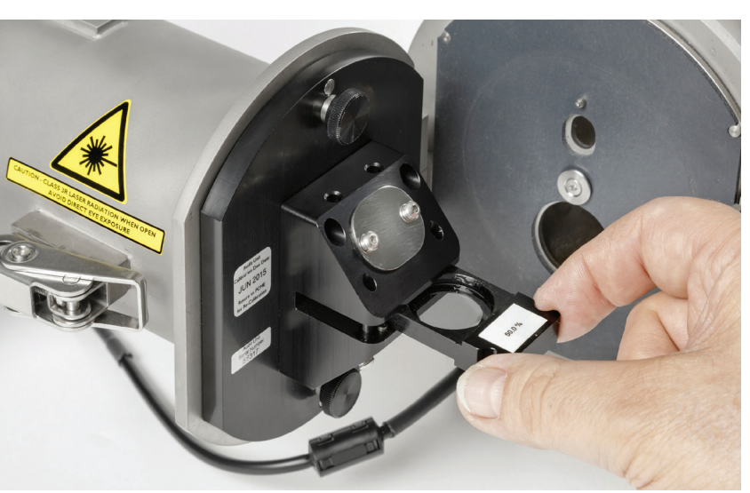
PCME QAL 360 shown with a multi-value Manual Audit Unit and attenuator

The automatic contamination check system (patent pending) ensures that any optical variances are measured, defined and adjusted to ensure zero and span drift is kept to a minimum.