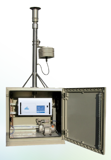
Example: wall-mounted version of the sampler, installed in a fixed, outdoor station