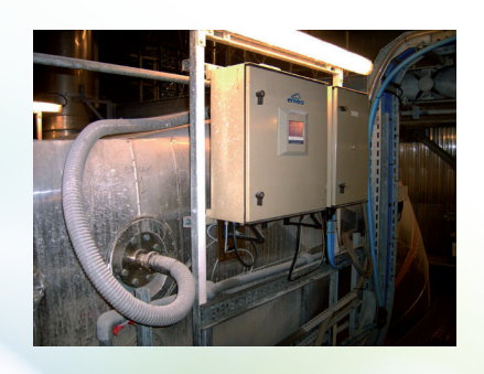
On-stack or close-coupled installation