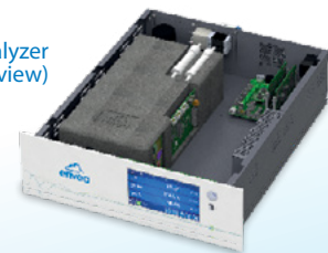
AF22e analyzer (internal view)