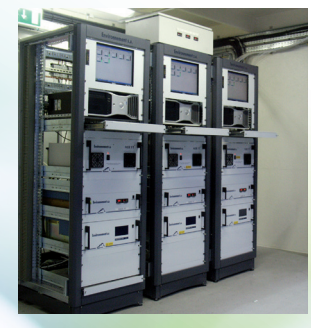
MIR FT rack cabinet