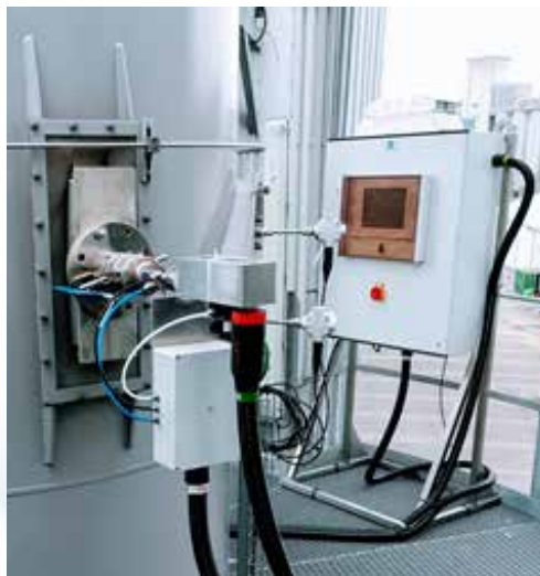
AMESA-B Control cabinet with sampling probe